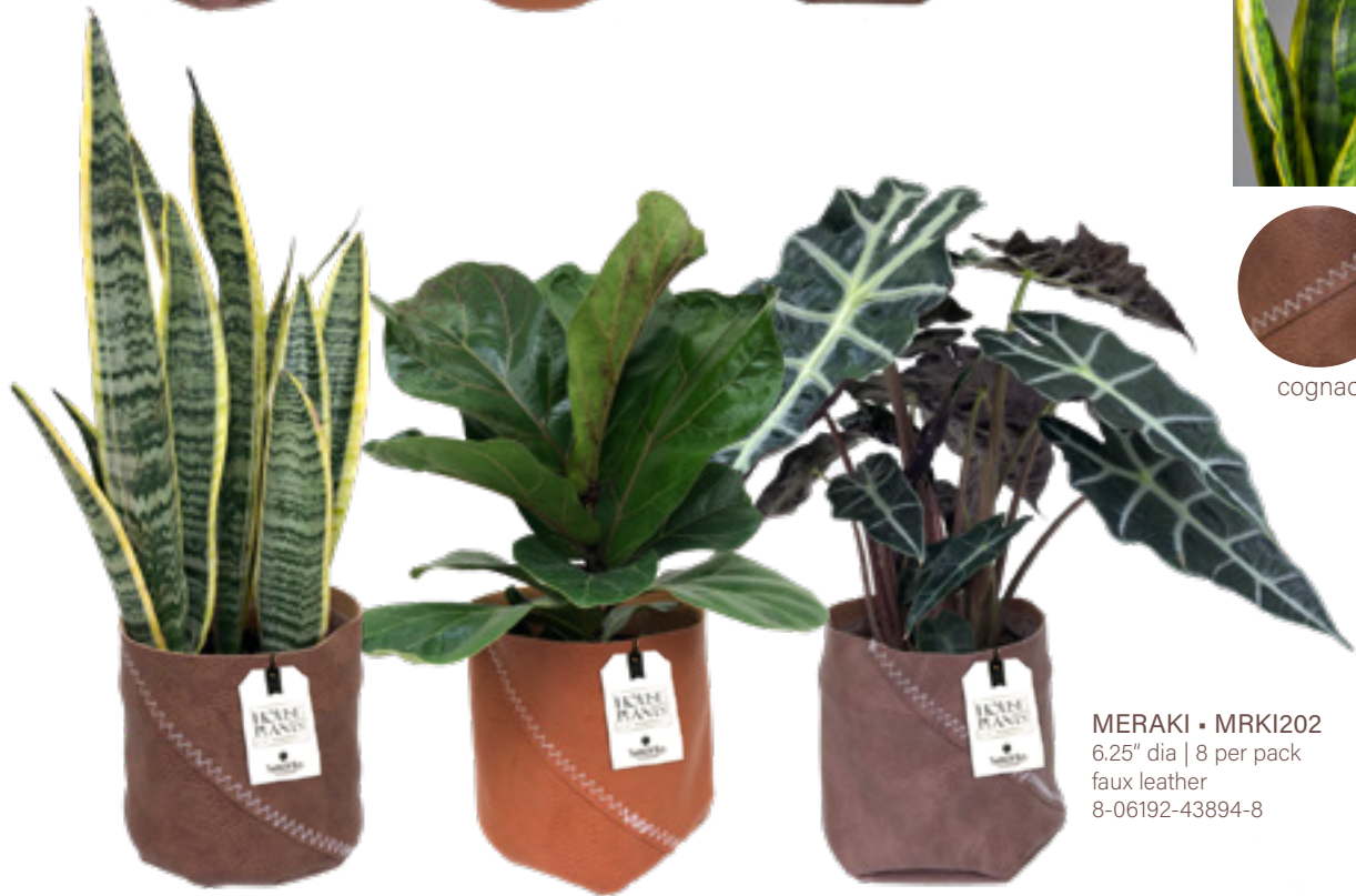
MERAKI • MRKI202 6.25" dia | 8 per pack faux leather 8-06192-43894-8