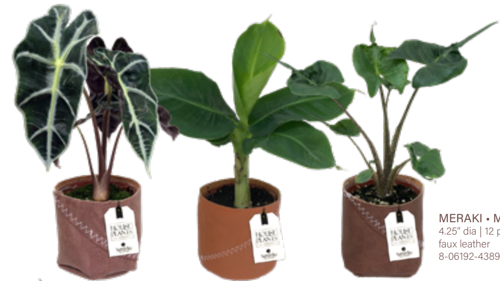
MERAKI • MRKI201 4.25" dia | 12 per pack faux leather 8-06192-43893-1