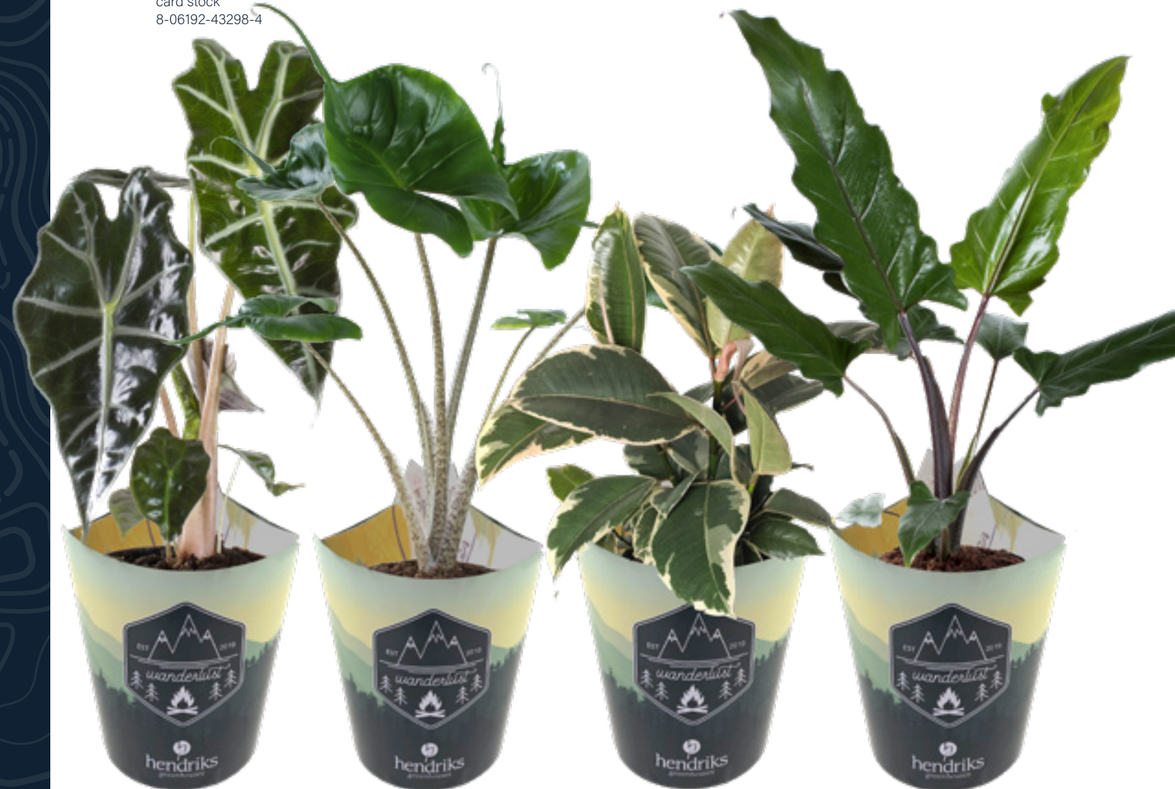
PLANTS WILL VARY DUE TO AVAILABILITY

WANDERLUST • WNDR104 4" dia | 18 per pack card stock 8-06192-43298-4