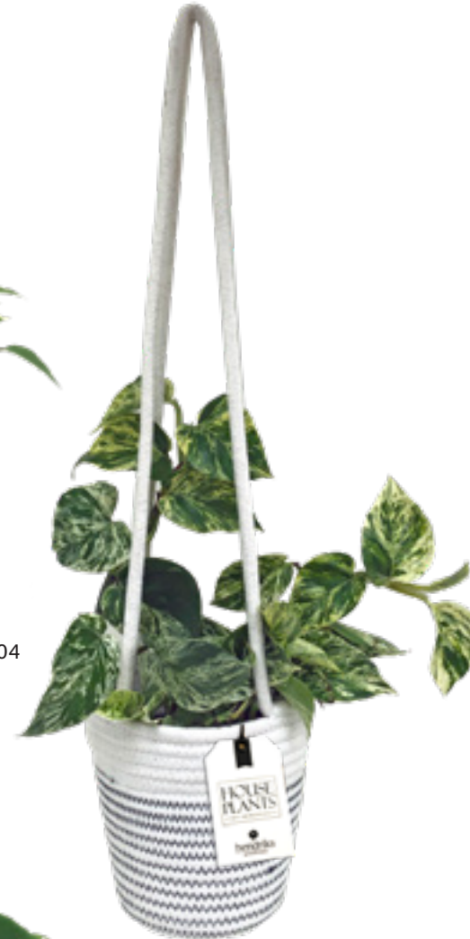
MANTRA • MTRA106 6.25" dia | 6 per pack cotton 8-06192-44083-5