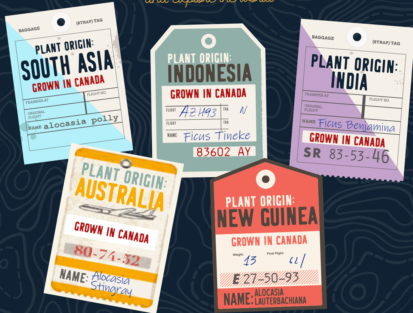
VARIETY SPECIFIC LUGGAGE STYLE CARE TAG

• a strong desire to wander or travel • and explore the world