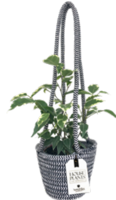
MANTRA • MTRA104 4.5" dia | 8 per pack cotton 8-06192-44082-8