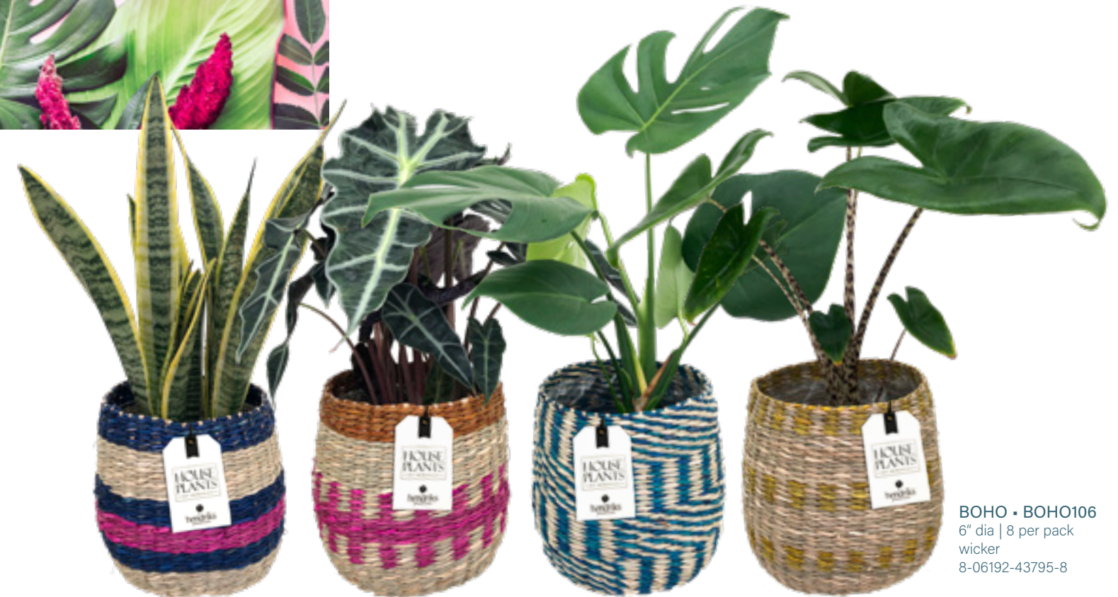
BOHO • BOHO106 6" dia | 8 per pack wicker 8-06192-43795-8