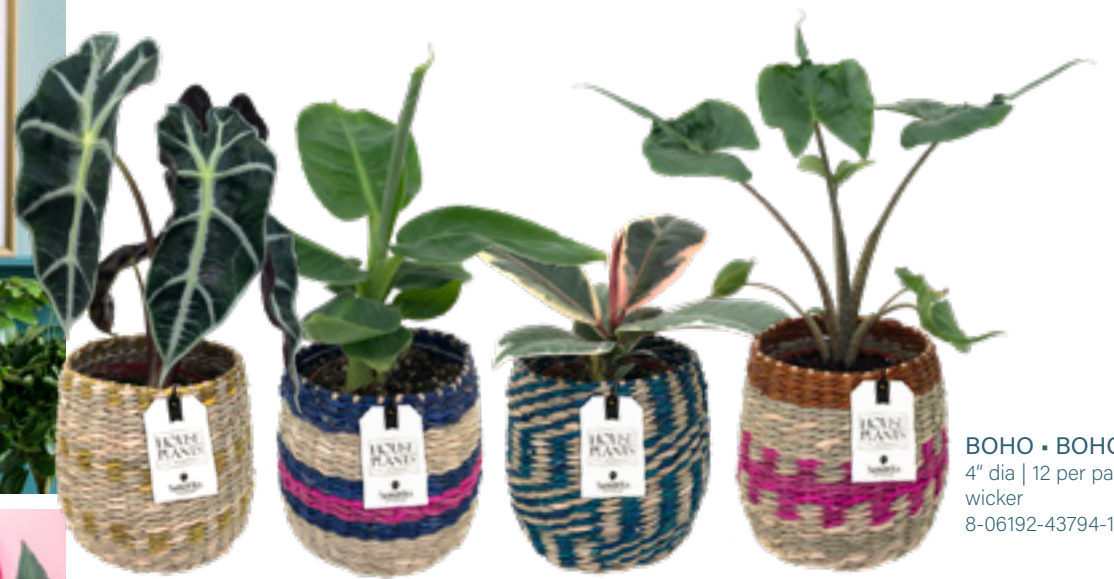
BOHO • BOHO104 4" dia | 12 per pack wicker 8-06192-43794-1