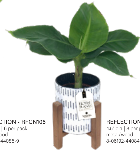
REFLECTION • RFCN104 4.5" dia | 8 per pack metal/wood 8-06192-44084-2