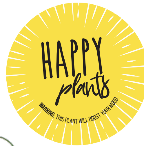
INFORMATIVE HAPPY PLANT CARE TAG