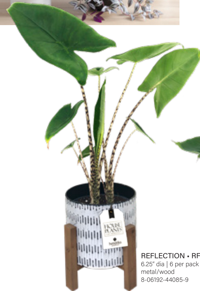
REFLECTION • RFCN106 6.25" dia | 6 per pack metal/wood 8-06192-44085-9