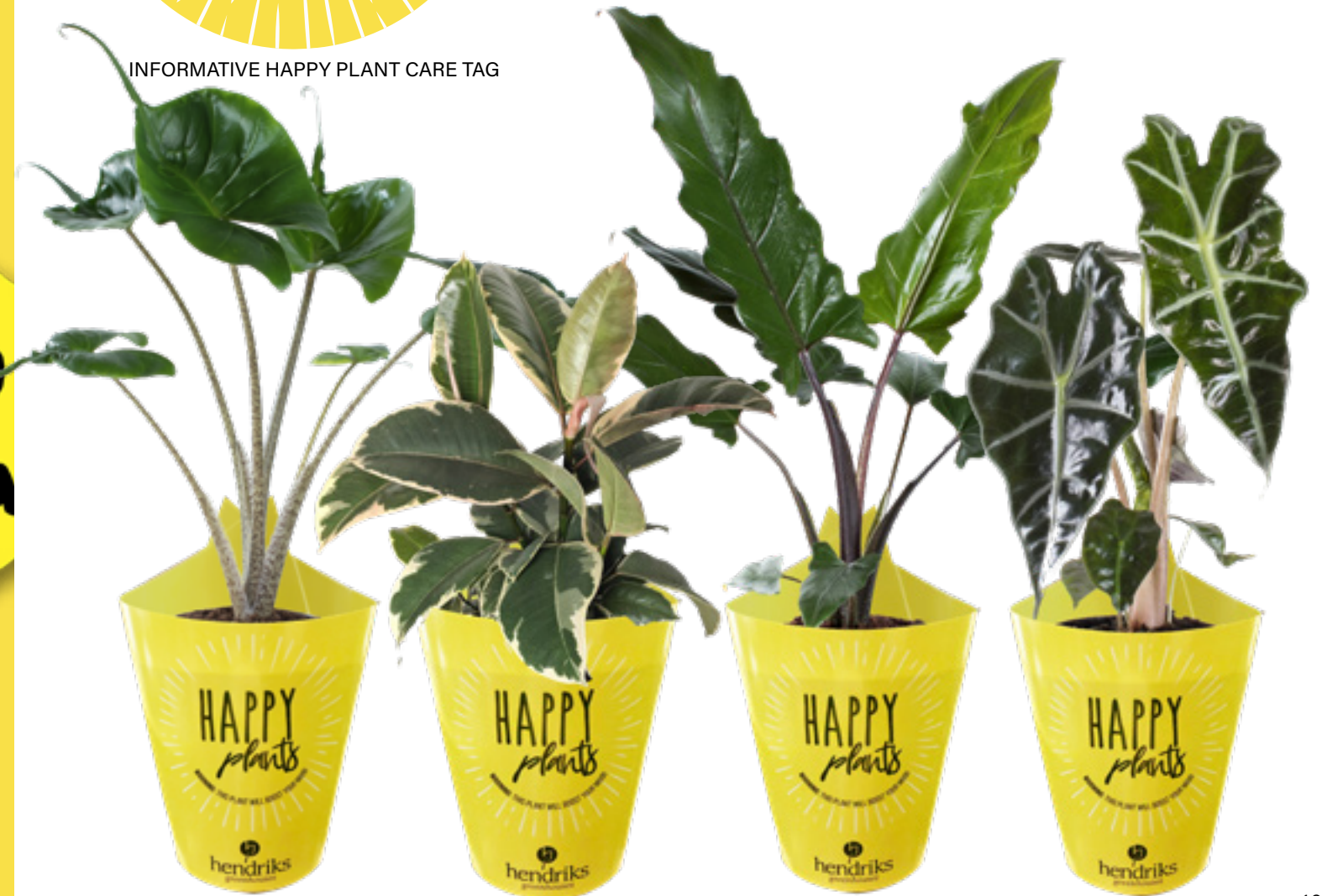
PLANTS WILL VARY DUE TO AVAILABILITY

HAPPY • HAPY4 4" dia | 18 per pack card stock 8-06192-43922-8